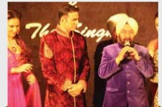
Jai Jawan, Jai Kisan