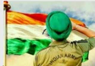
Army preparatory Course