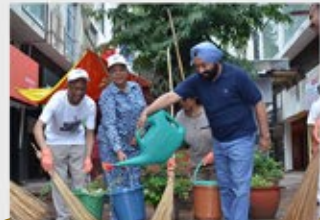
Swachh Bharat Abhiyan