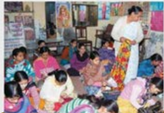
Angles of Sun