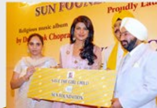
Save The Girl Child