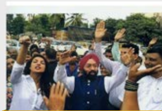
Swachh Bharat Abhiyan