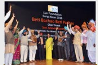
Beti Bachao Beti Padhao